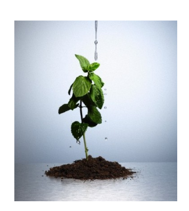
One solution for many needs